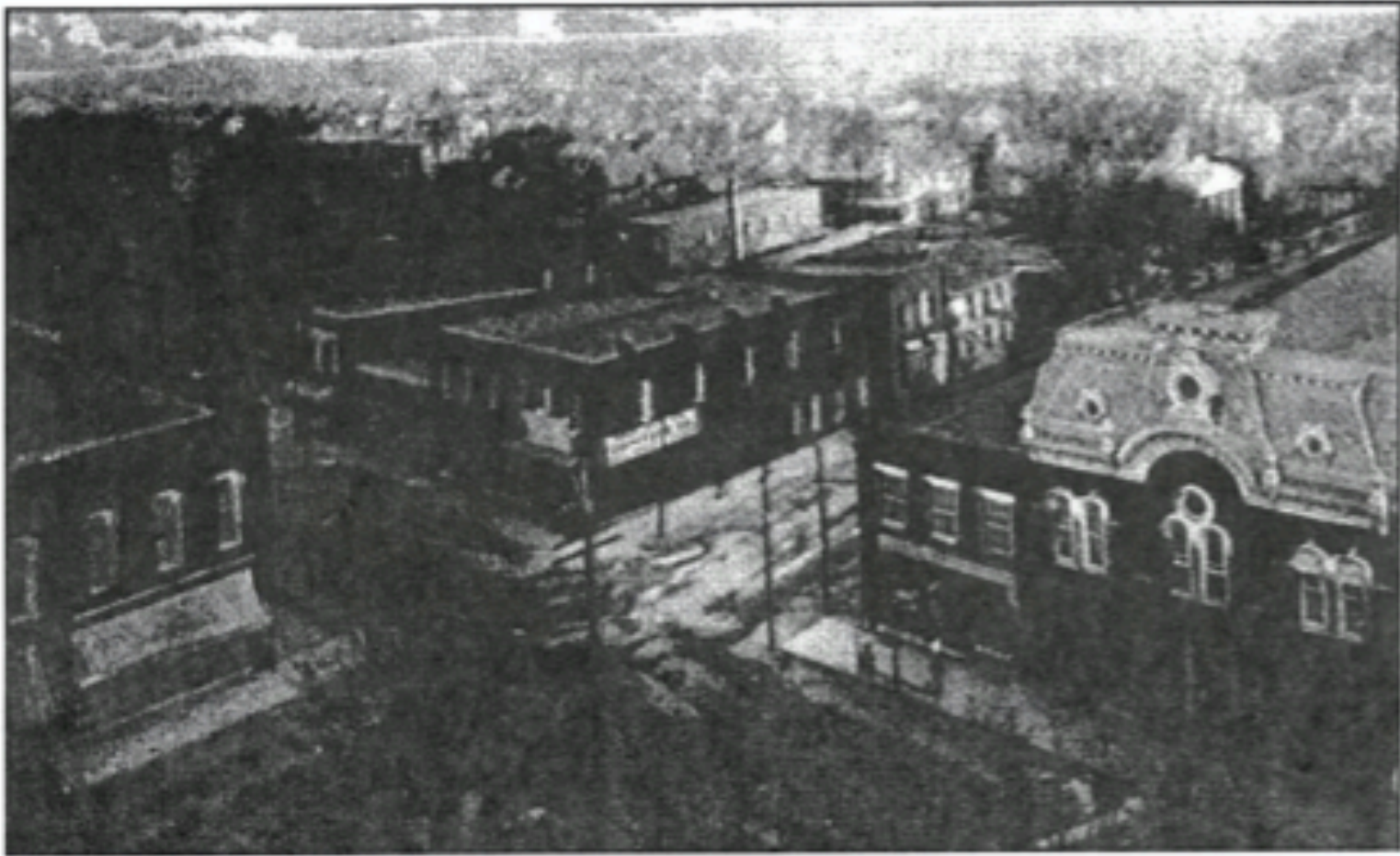
East view of Craigmiles Hall from Court House. Notice the mud streets.